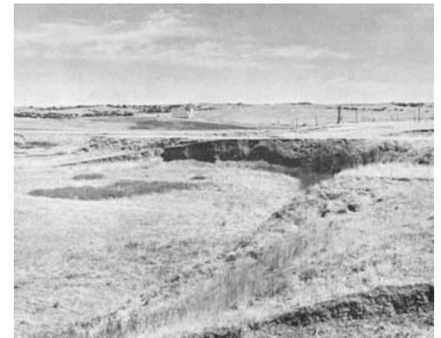
Site of Wounded Knee Massacre

Explain the controversy about medals of honor awarded at Wounded Knee.