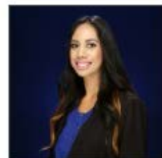
Star Wildes Member