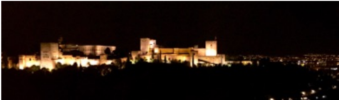
La Alhambra from El Mirador de San Nicolas .