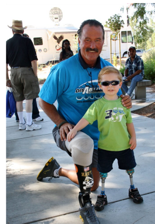
DisAbility Sports Festival Participants