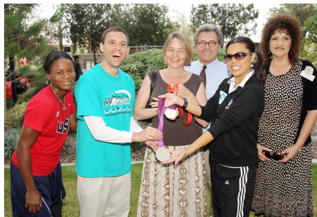
DisAbility Sports Festival Opening Ceremony