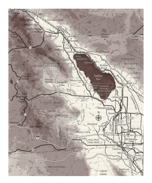
Salton Sink, California.

In 1906 and 1907 after another season of flooding, the biodiversity of the Salton Sea area, including large populations of waterfowl, like white pelicans, cormorants and brown pelicans, was finally recognized. Soon thereafter, sport fishing began to be promoted. From 1917-1918, during World War one, the catching of mullet became a lucrative business to the Salton Sea. <sup>10</sup> After World War One ended, the Salton Sea became a tourist attraction for its mullets and Mullet Island on the south side of the Sea.