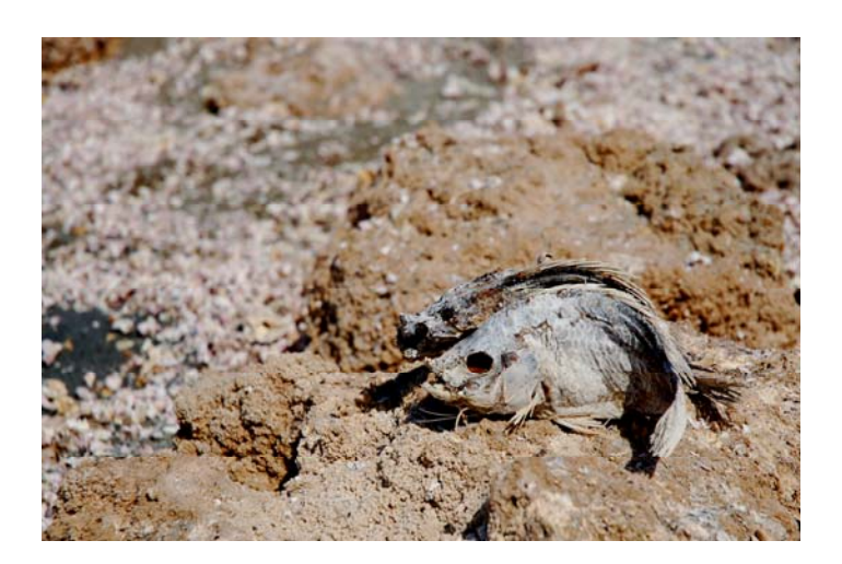
Home to more dead fish than people, skeletons and remains of massive fish and bird die-offs can be found scattered along the shoreline of the Salton Sea. While approaching the sea, instead of sand, you can hear the crunch of bones and barnacles under your feet.

Visible from space, the Salton Sea's surface area is approximately 380 square miles, roughly twice the surface area of Lake Tahoe. It measures 15.5 miles across its widest point and 36 miles in length. The Salton Sea we recognize now "is a body of water that currently occupies the Salton Basin." However, it is not the first body of water to do so. The ancient coastline of the Gulf of California once extended as far north as Indio. As silt accumulated from the Colorado River, it enclosed and separated the newly formed Salton Sea from the Gulf. This basin, or sink, is approximately 280 feet below sea level, with the surface of the sea at around 220 feet below sea level. The original lake did eventually dry up completely, but several lakes have formed on and off within the basin, due to the unpredictable Colorado River which changed its course and directed water into the basin on several occasions.