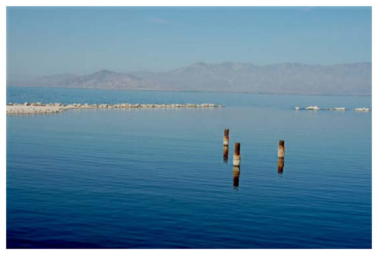
Though a beautiful shade of blue in this photo and from afar, up close the Salton Sea resembles more of a dark, amber beer with dead fish floating in it.

C.E. to the current increasing levels of salt responsible for algae blooms and wildlife mortality. Once a hub for the wealthy to dock their yachts, water ski and relax, all that remains of the Salton Sea's former glory are a few run-down, graffiti-covered yacht clubs, an eerie shoreline playground and a question about its rise and fall.