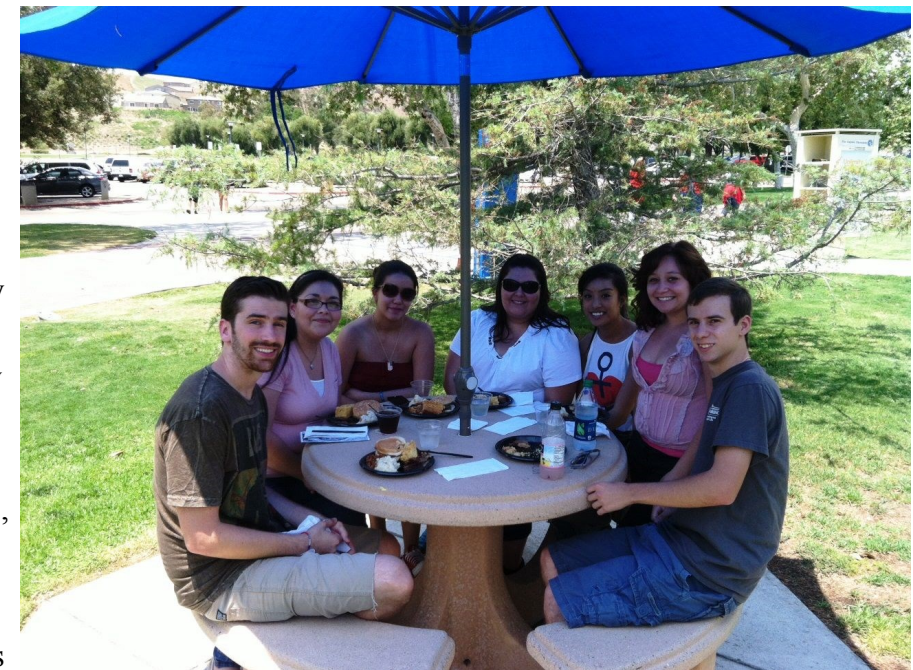
Students enjoying their lunch during the open house nation's 237th birthday. The 4th of July, 2013, finds our country facing many challenges and we're rising to meet them. Today and every day, we are grateful for our freedom and proud to be Americans.

We are truly honored to have the campus community join us in celebration of our