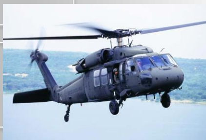
UH-60 Black Hawk Helicopter

This will also mark the second year that CSUSB will participate in the Tie a Yellow Ribbon Campaign. For a long time ribbons have been displayed as a symbol of remembrance for those who are serving in places far from home. In honor of Armed Forces day, yellow ribbons will be displayed on the trees throughout the CSUSB campus to remind us of the California soldiers, marines, sailors and airmen that are currently deployed and although, they have left us and have been sent to places far way, we will think of them and wait for them until they return home.