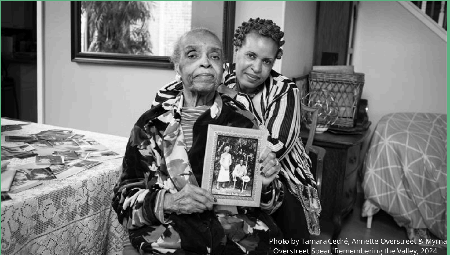
Photo by Tamara Cedré, Annette Overstreet & Myrna Overstreet Spear, Remembering the Valley, 2024.