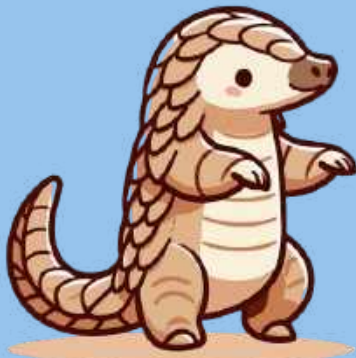
Penny the Pangolin UHP'S UNOFFICIAL MASCOT

"Do not go where the path may lead. Go instead where there is no path & leave a trail" ~ Ralph W. Emerson