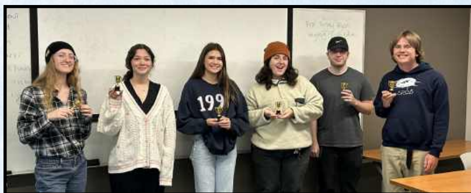
Our Earth Day Jeopardy Winners!