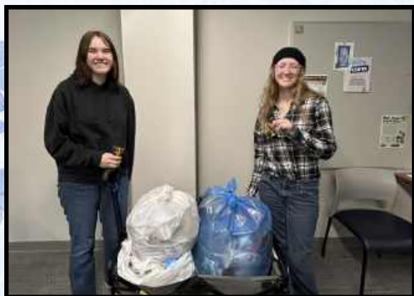
Our TRASH Pick-Up Winners!