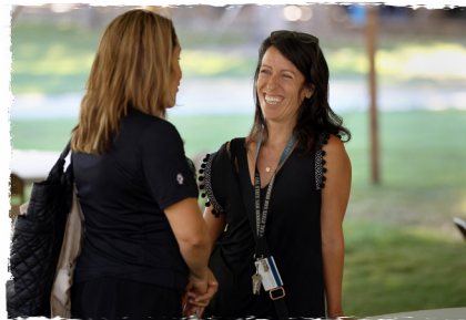
Friends catch up on summer events.