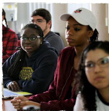
One of the many workshops held during Graduate Education Week.

We hope you had the opportunity to participate in one (or all!) of our Graduate Education Week events, and look forward to doing it again next year!