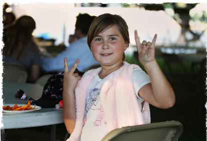
A future Coyote gets ready to join the pack.