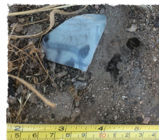
Circle dragonfly sherd