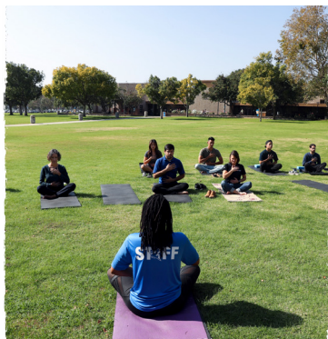
Yoga on the lawn.

That same afternoon, we invited the campus community to our Graduate Studies Open House , where guests were treated to hot chocolate and cookies in our courtyard. We gave away two gift baskets, shared information on our outstanding graduate programs, and had a great time encouraging future coyotes to join the pack!