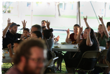
Grad students and their families had a howling good time!