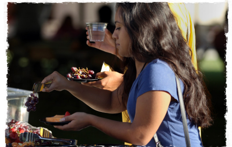
Participants dined on hot dogs, fresh fruit, and a lemonade bar.