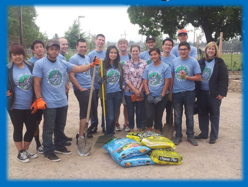
"Coyote Cares Day gave us students a chance to make a difference in our community"

On April 12, 2014, seven student veterans, service members, a dependent, an alumni and the director of the Veterans Success Center participated in the university's Coyote Cares Day. The event began at 8 a.m. with a free breakfast in the Obershaw Dining Room. Students were then transported by vans to a variety of organizations throughout San Bernardino, where they provided community service activities such as clean-up, painting, beautification and restoration. Student veterans chose to volunteer at the Veterans Exploration Garden in Speicher Park. Last year, more than 250 students, faculty, staff and alumni volunteers came together to complete projects that benefit San Bernardino and other nearby areas as a way of thanking the community for their support of the university.