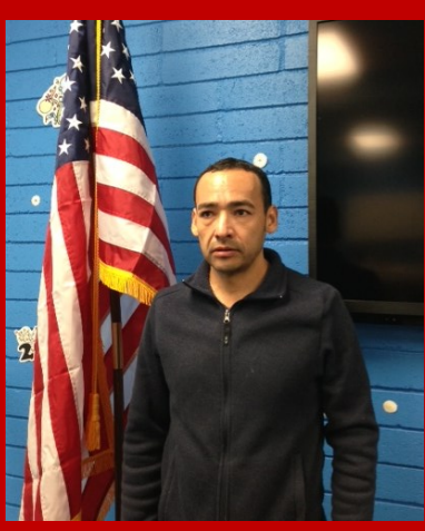
Pictured with the American flag