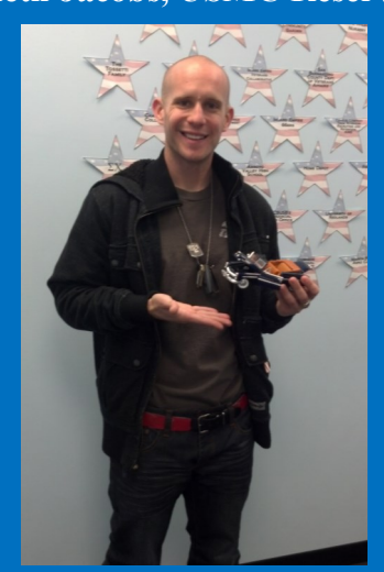
Pictured with the vintage model car and belt that he made

Save enough money to chrome out my Harley Davidson motorcycle.