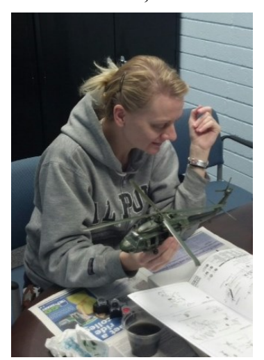
Pictured with the Blackhawk helicopter model she is making

Finish all of my projects that are currently housed in grocery bags.