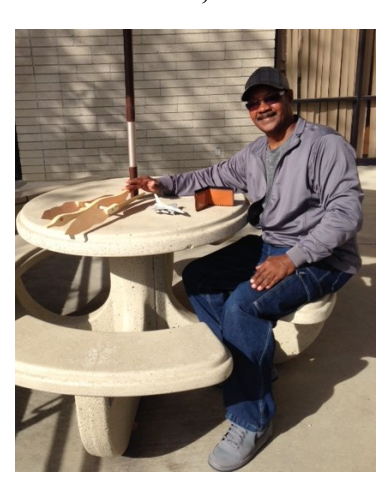
Pictured with the duck, wallet and model plane he