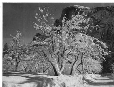
Half Dome, a famous rock formation in Yosemite. Photo by Ansel Adams, a famous nature photographer and admirer of John Muir.