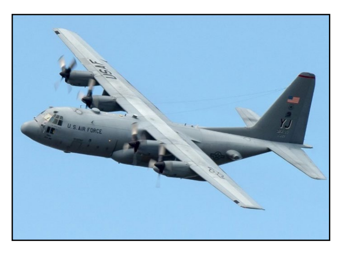
USAF C-130 One of the many air craft helping the firefighting efforts.

CalFire Caldor Incident Report CBS 13 CA National Guard on Patrol in South Lake Tahoe KCRA3 US Military Firefighting Aircraft Assist Wildfire Efforts US Army News – ARNORTH's Support NIFC in California US Army News – Cal Guard MPs support CHP