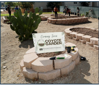
Special thank you to Grounds Maintenance, ASI, SAGES for their support. And most importantly, thank you to our volunteers!