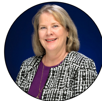
By April Lane, MPH, CHES

I hope you found this information helpful. Until next time, I wish you a wonderful summer break and sweet dreams.