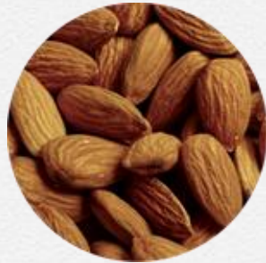
Nuts & Seeds