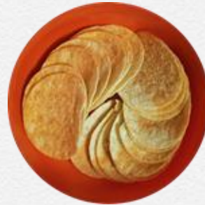
Chips & Crisps