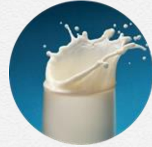
Juice & Milk