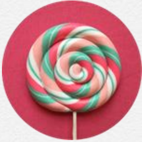
Confectionery & snacks