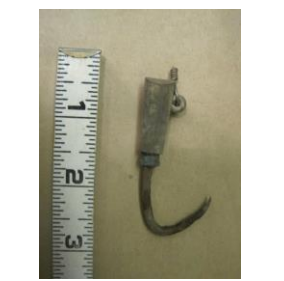
Japanese tuna fish hook found by CSUSB students during dig.