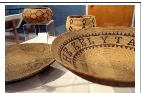
Baskets from Cahuilla and Chemehuevi tribes are displayed in a new exhibit called Journey of a People: A History of the Cahuilla & Chemehuevi Tribes at the Coachella Valley History Museum in Indio.

http://www.mydesert.com/article/20130920/NEWS01/309200031/Coachella-Valley-History-Museum-exhibit-details-history-Cahuilla-Chemehuevi-tribes