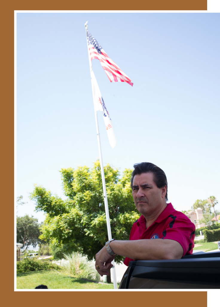
"Wanting to leave Germany in a hurry after thirty-two and a half months of dealing with beatings, death threats, and prejudices, I didn't even bother asking for any ribbons or sleeve hash marks."

When people ask me what I think of myself as, I say American. I don't let what's happened to me take that away.