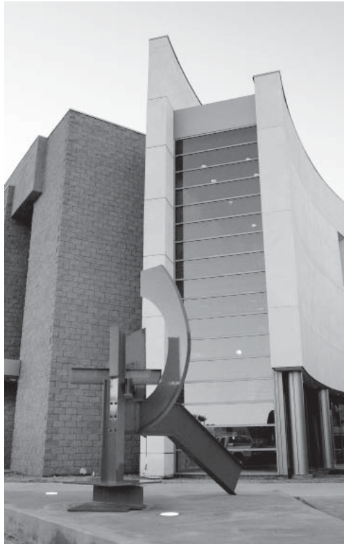
The Indian Wells Center for Educational Excellence at the Palm Desert Campus

Organ Donor Leave. A paid leave of absence not exceeding 30 consecutive calendar days in any one-year period is available for any employee who is donating an organ to another person. A paid leave of absence not exceeding 5 consecutive calendar days in any one-year period is provided to any employee donating bone marrow to another person. Contact Human Resources for further information.