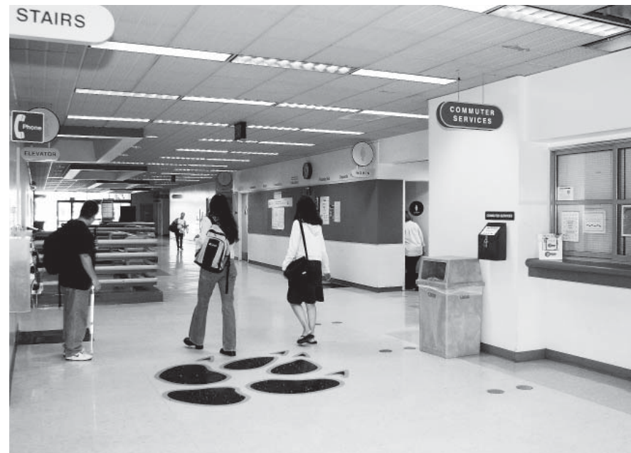
Inside University Hall

CSUSB is normally open for business from 8 a.m. to 5 p.m., Monday through Friday. If a summer schedule is in place, the hours are 7 a.m. to 5:30 p.m. Monday through Thursday, closed on Fridays, during the designated summer months. You will be assigned a work schedule and you will be expected to begin and end work promptly according to your schedule. In order to accommodate the needs of our business, it may be necessary to