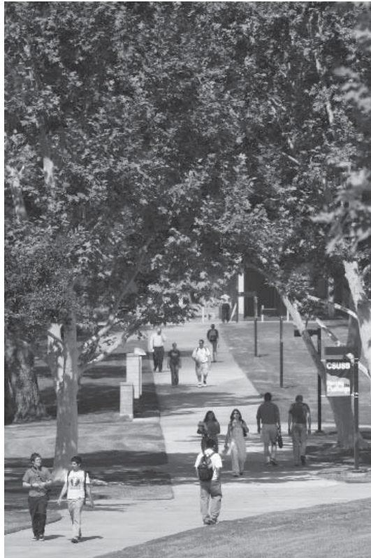
Students at the quad

Benefits for employees whose terms and conditions of employment are covered by a collective bargaining agreement may differ from the benefits described above. Please refer to your collective bargaining agreement for a description of the benefits to which you are entitled.