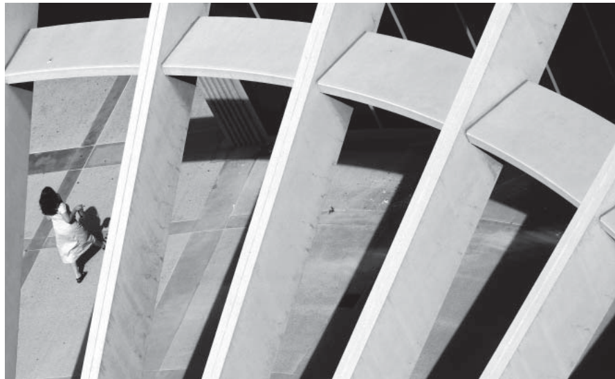
Looking down from the Pfau Library

CSUSB provides paid accrued sick leave to all eligible employees for periods of temporary absence due to personal illness or injury; disability related to pregnancy; exposure to contagious disease; dental, eye or other physical or medical examinations or treatment by a licensed practitioner; illness or injury in the immediate family not to exceed five days in any calendar year; death of a person in the immediate family. CSU Collective Bargaining