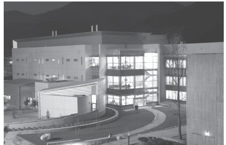
Chemical Sciences Building

If you have a potential grievance or complaint you are encouraged, whenever possible, to resolve it informally with your immediate supervisor. If resolution is not possible on an informal basis, you may elect to file a formal grievance or complaint with the appropriate administrator, in