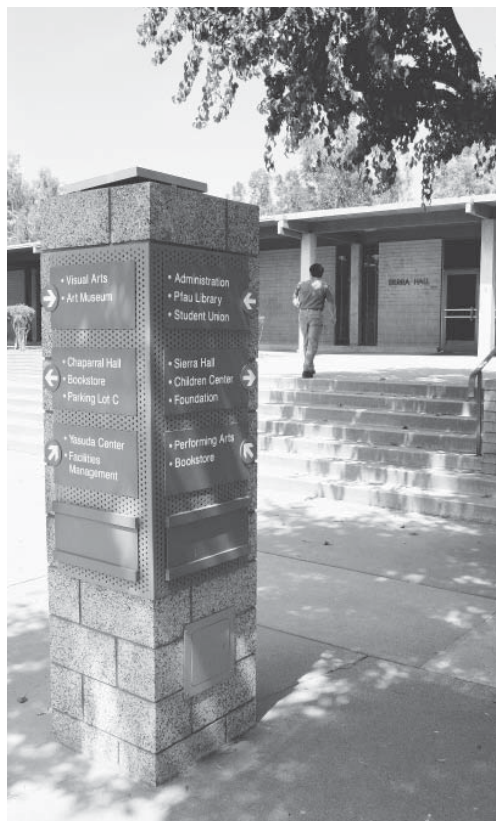
Sierra Hall, Human Resources Office

For vehicle safety, please remember to lock your vehicle, and upon returning to your vehicle, check your surroundings for suspicious persons. Remember to immediately report any suspicious person or circumstances to the campus police.