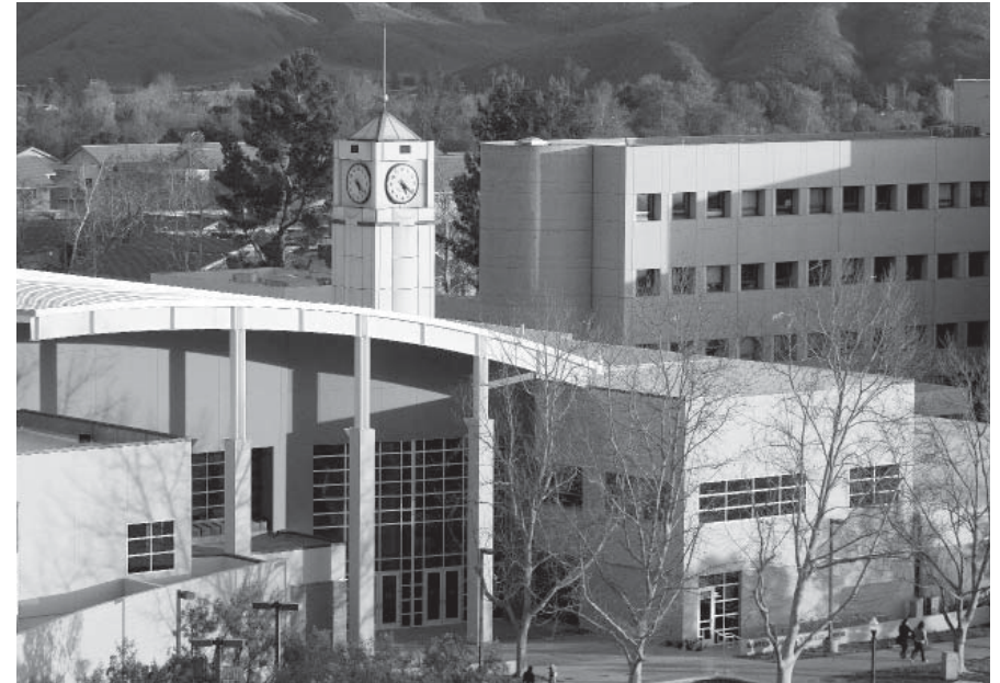
The Santos Manuel Student Union

If you serve on jury duty, you will receive your regular salary, provided the money received for such duty is remitted to CSUSB for deposit in the state fund. Payments for travel and subsistence need not be remitted. If you retain jury duty fees, you will not be compensated for