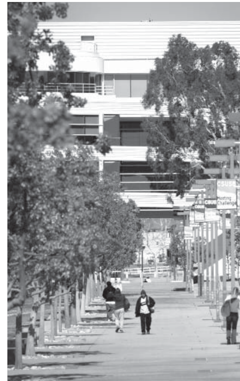
College of Social and Behavioral Sciences Building

The university provides annual recognition for employees who have reached 5, 10, 15, 20 and 25 or more years of service.