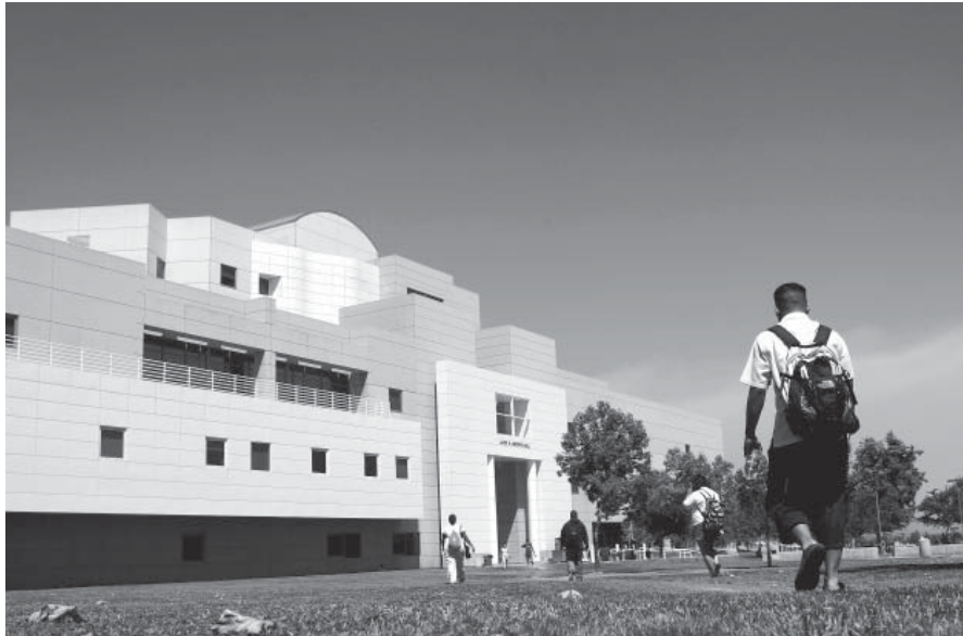
Jack Brown Hall