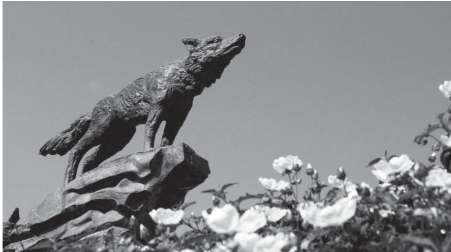
Coyote sculpture, Coyote Drive entrance