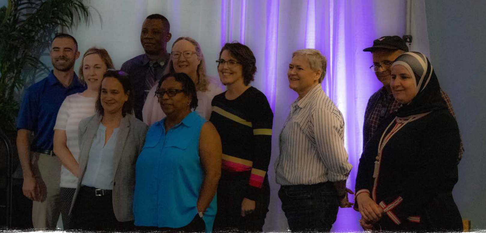
Faculty that served as committee chairs on theses, projects, and dissertations were recognized at the Graduate Education Week brunch.