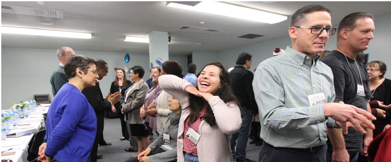
Coyote Career Network mentors and mentees engage in the speed networking activity

These guidelines offer a set of concrete suggestions that can be applied to any discipline or domain to ensure that all learners can access and participate in meaningful, challenging learning opportunities. UDL pedagogy is considered the best practice in ADA accessibility. 8