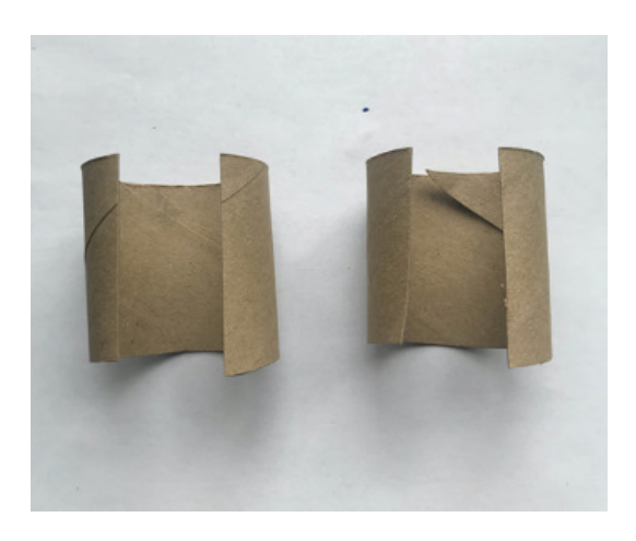
STEP FOUR: CUT OUT YOUR SNAKE