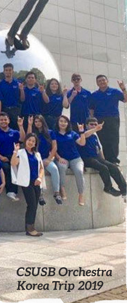
CSUSB Orchestra Korea Trip 2019