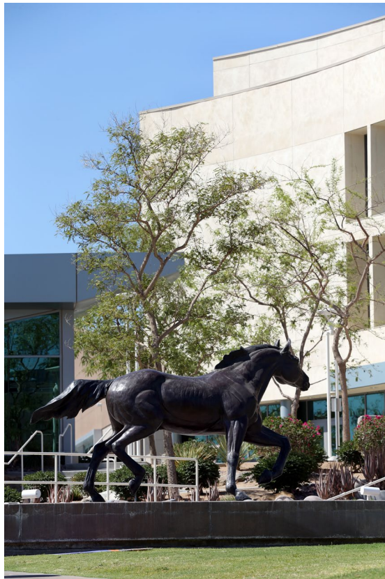
PALM DESERT CAMPUS

JEANNE CLERY DISCLOSURE OF CAMPUS SECURITY POLICIES & CAMPUS CRIME STATISTICS ACT (20 U.S.C. § 1092(F))