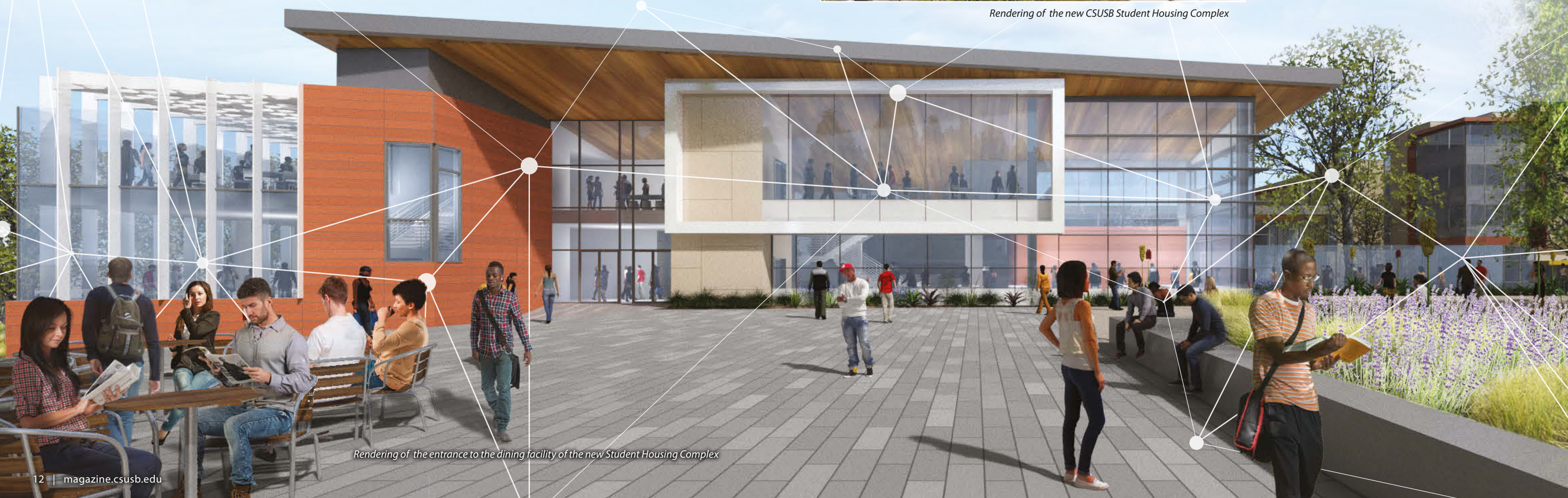
Rendering of the entrance to the dining facility of the new Student Housing Complex

Construction of the new complex, coupled with the fall 2016 launch of CSUSB's Faculty-in-Residence (F-I-R) program, have signaled an evolution in campus life. This monumental step gives CSUSB momentum as it expands its well-rounded student living and learning community.