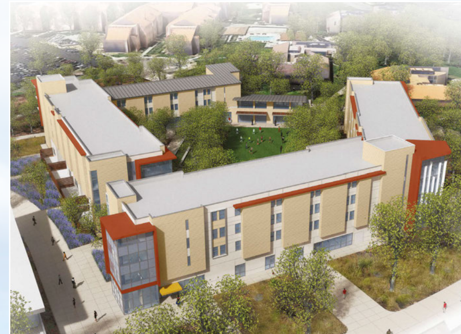
Rendering of the new CSUSB Student Housing Complex

Upon completion, the initial phase of the new multipurpose complex will augment housing to accommodate 416 incoming full-time freshmen and further the university's master plan to ultimately house 5,000 students. The university presently has three student housing facilities — Arrowhead Village, University Village and Serrano Village, which combined have capacity for nearly 1,500 students. This latest construction will increase that number significantly. And as CSUSB's enrollment grows, the new residential community will eventually serve nearly 1,200 additional students.