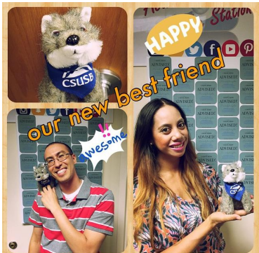
Check him out on our social media

Introducing: Coyote Bill our new best friend!