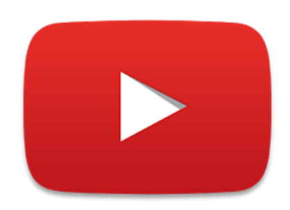
Select play button to view video

"Pride does not even begin to describe how I feel about my academic progress since resuming my studies and being offered this amazing opportunity."