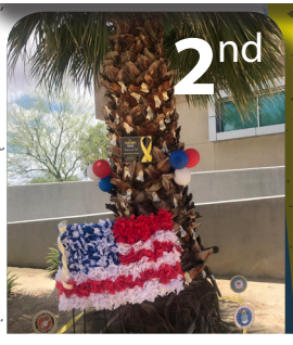
Rancho Mirage Student Center (RMSC)

Thank you to all of our participants in this year's Yellow Ribbon campaign. We appreciate your support.