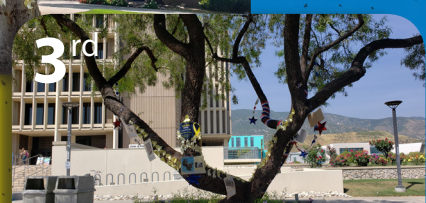
Office of Community Engagement