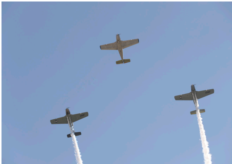
Mentor Heritage Foundation pilots demonstrate Fingertip formation in T-34 mentor planes.