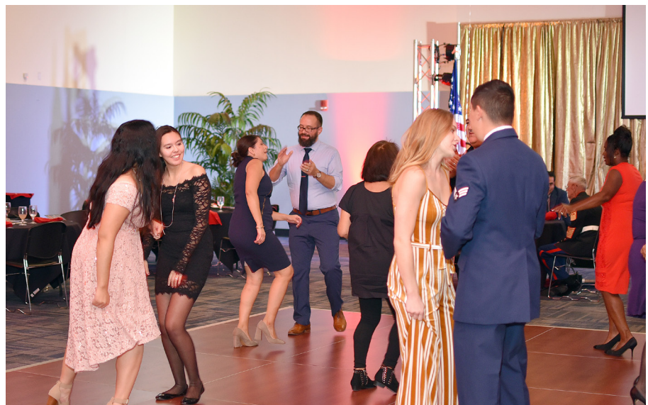
Attendees of the ball enjoy good music with a bit of dancing.