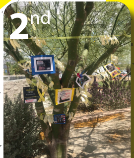
PDC Student Health