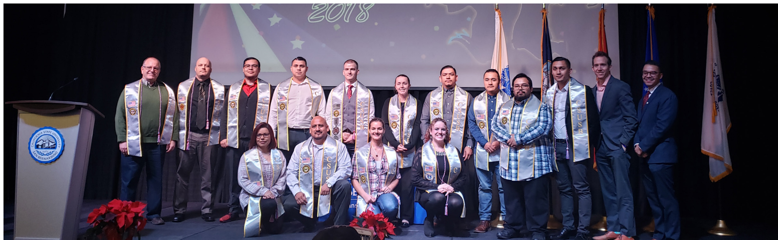
Congratulations Fall class of 2018!