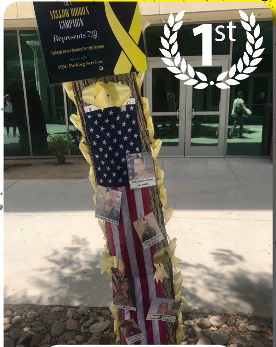
PDC Parking Services