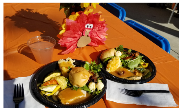
Guests at the luncheon were provided with a lovely Thanksgiving meal.

This event was sponsored by AmVets, San Bernardino Rotary North, Sodexo, Community Action Partnership of San Bernardino County, Alaska USA Federal Credit Union, The Obershaw DEN, and the CSUSB campus community, and we are grateful for all of their contributions.