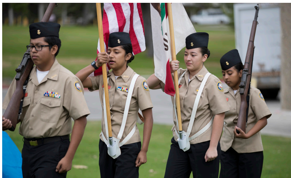
Chaffey High School NJROTC presenting the colors.