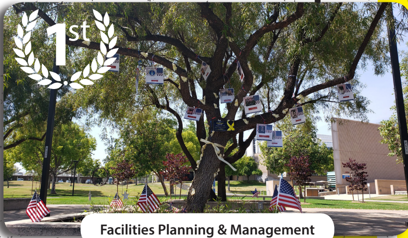
Facilities Planning & Management