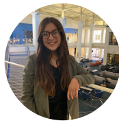
Alessandria Felix Health Science