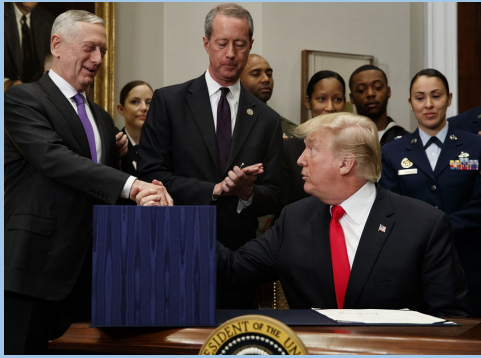
Above: President Donald Trump shakes hands with Secretary of Defense Jim Mattis after signing the National Defense Authorization Act for Fiscal Year 2018, in the Roosevelt Room of the White House Dec. 12

On December 13, 2017, President Donald Trump signed the annual defense policy bill into law, officially establishing the 2018 military pay raise at 2.4 percent and setting the stage for increased Pentagon spending in the next upcoming months. The 2.4 percent pay raise is the largest the military has received in eight years. Initially the White House and Pentagon intended for a smaller paycheck boost; however, the raise matches the expected growth in private-sector wages for next year. According to the officials, the raise “translates into about a $680 dollar annual boost from 2017 pay for younger enlisted ranks, and about $1,080 a year for more senior enlisted and junior officers. A mid-career officer will see almost $2,000 a year extra under the plan.” The $700 billion authorization bill also calls for a large purchase of ground combat vehicles, new aircraft, ships and an upgraded missile defense system. It also includes about $66 billion for overseas operations, which Trump states service members “need to fight and win.”