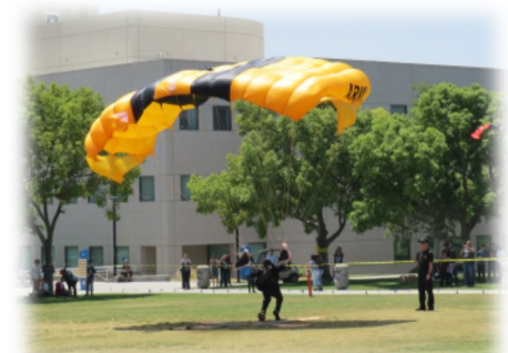
Golden Knight lands on the library lawn