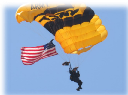
Golden Knight soaring above campus