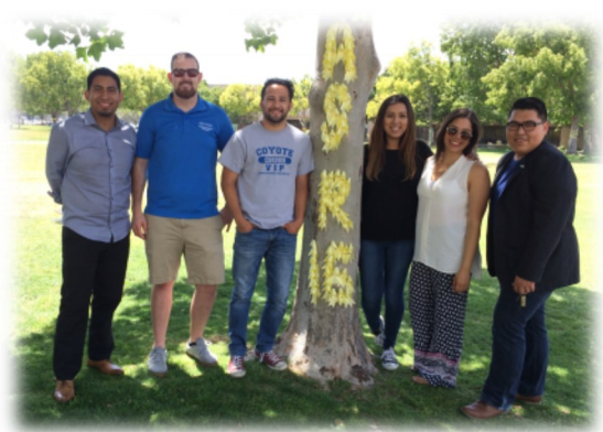
Students pose with their decorated tree

The Veterans Success Center at CSUSB San Bernardino campus hosted the Armed Forces Day-Yellow Ribbon Campaign on May 18. The event was a huge success with diverse programs and showcases demonstrating the high technology levels of all the forces, and the spirit of unity and teamwork among service members. The highlight of the event was the Golden Knights. The Army Parachute Team made excellent landings on the target without a hitch despite the windy conditions. For the Yellow Ribbon Campaign, various campus departments to student organizations and volunteers gathered on the library lawn with the sole wish and hope for safety and the wellness of military members deployed around the globe. The decorated trees brought awareness and appreciation for our fighting forces by reminding us of the importance of national defense and peacekeeping.